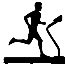
“Let us hold fast the profession of our faith without wavering; (for he is faithful that promised).” (Hebrews 10:23)

faith that pleases God always focuses absolutely on the Word of God and the Faithfulness of God to unfailingly perform every promise that He has made in His Word! (see Romans 4:19-22). Genuine Faith never stands in the wis-